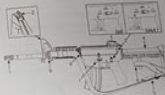
LEFT VIEW MAGAZINE