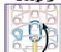
Grab the blue band on the center pin