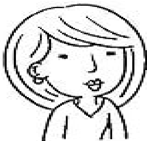
Voici 1. Ma mère Vwah see mah mare