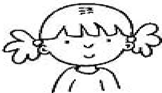
3. Ma soeur ma sur