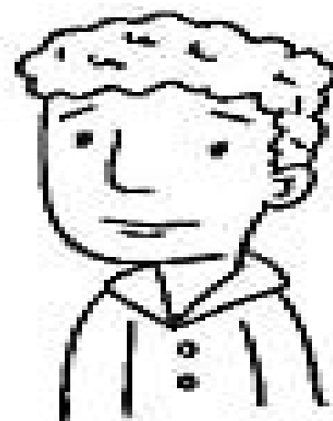
2. Mon père mone pare