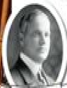
BENJAMIN GUGGENHEIM

Survivors have given accounts of the bravery of those who went down with Titanic . Among those celebrated as heroes were the ship's musicians, who played in the ship's yard, and the US millionaire Benjamin Guggenheim.