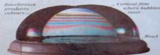
THIN FILM INTERFERENCE