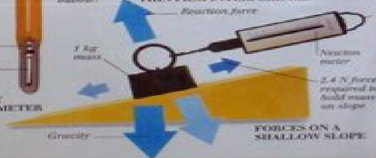
FORCES ON A SHALLOW SLOPE