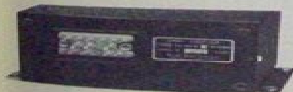
OMNI COUPLER NAV-O-MATIC 300 PART NO. 28900