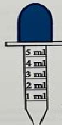
D. Oral Dropper

Answer the following questions 92 through 95 referring to the above devices.