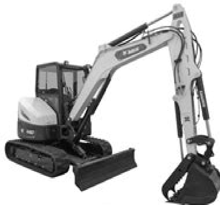
E60 SM: E4GR11001 & Above