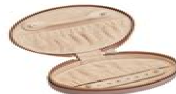
8. TRAVEL JEWELRY CASE