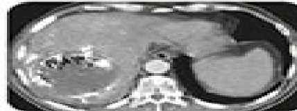
Hepatic FDG Uptake in PET/CT