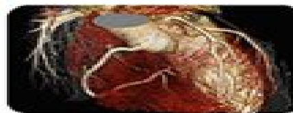
Cardiac Dual Source CT

New: Clinical Benefit of PET/CT Applications