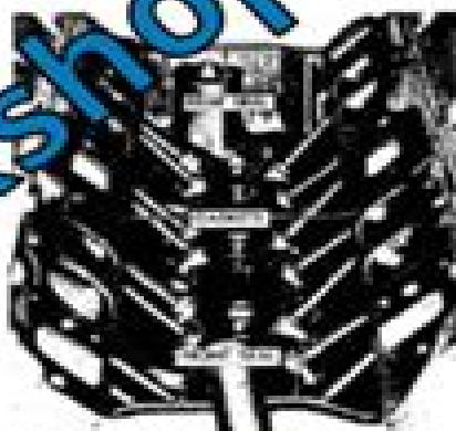
Installation instructions, product and user information

19. Disconnect the negative cable from the motor's input terminals. (The positive position, usually CTS).