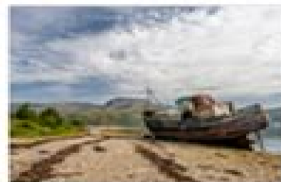
The Corpach Wreck and Ben Nevis