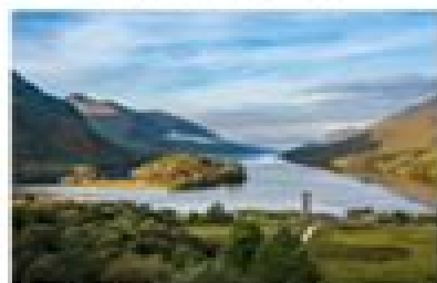
Glenfrian Monument, NTS and Loch Shiel