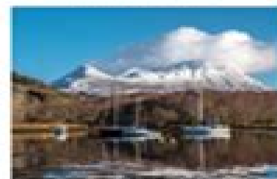
Isles of Glencoe