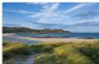
Sanna Bay, Ardnamurchan