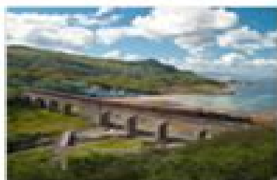
The Jacobites, Loch nan Uamh Viaduct