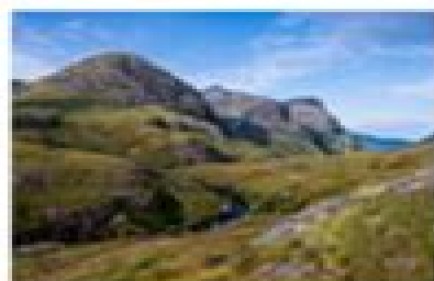
Three Sisters, Glencoe