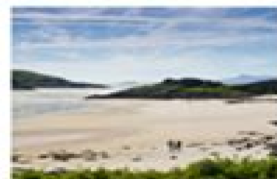
Silver Sands of Morar