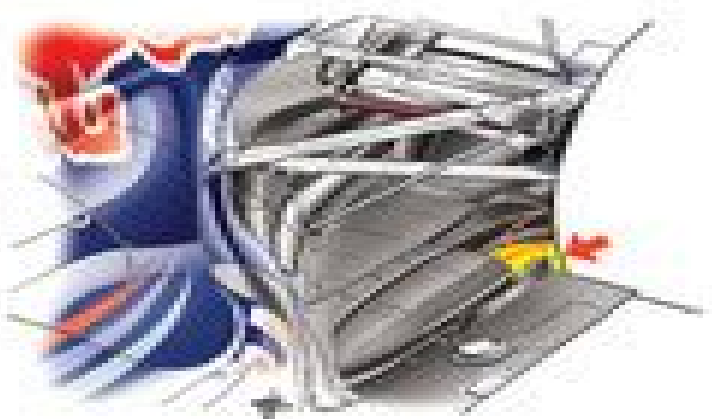
Illustration by N. ADOLFO