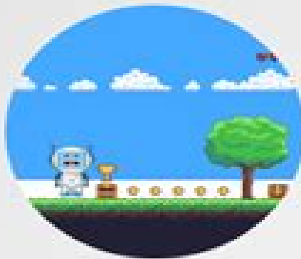
Gamification in Language Learning