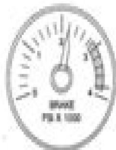
Part No. 115-105

The Brake Pressure Indicator converts to signal source in the landing gear system and shows the brake pressure at the rear and main landing gear wheels. The Hydraulic Pressure Indicator converts to a signal source in the hydraulic system and shows the aircraft hydraulic pressure.