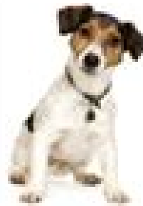
Jack Russell Terrier