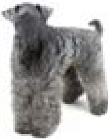
Kerry Blue Terrier