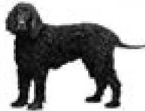
Irish Water Spaniel