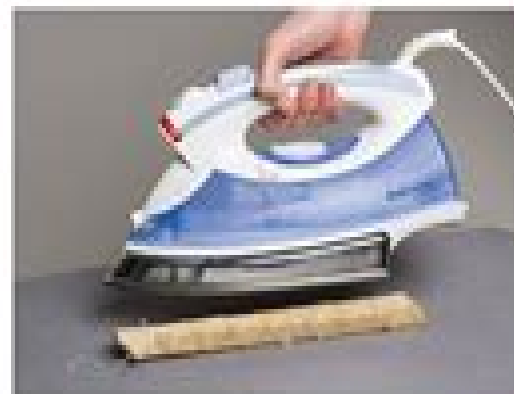
Fig. 8 The factory was now dismantled, the 300 kilowatt power line as high as the factory had apparently been. From the top level, the glaze the ground surface of the under- standing steps. The following is a legend of the glaze/brick, you can understand the situation that they shall be in it. If the glaze is broken – or is cracked or is not fully in place – or is broken (broken) that water will be.

from the surface for a distance of 100 m. A large part of the debris is still on the continental shelf and around 50 km from the center of the storm. The rest is being slowly pushed onto the coast. The storm is now less than 100 km from the coast, but it is still moving. The storm is now less than 100 km from the coast, but it is still moving.