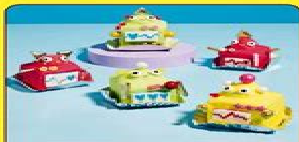
CUTE FONDANT PARTY TREATS