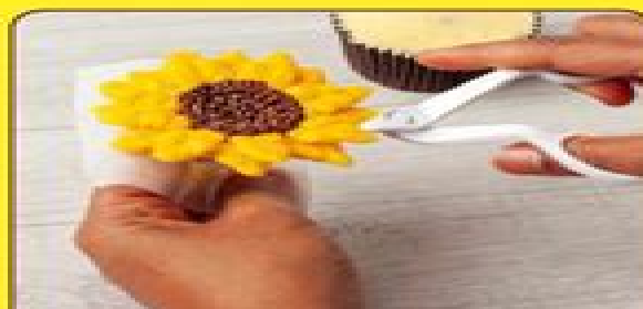
SIMPLY STUNNING FLORAL IDEAS