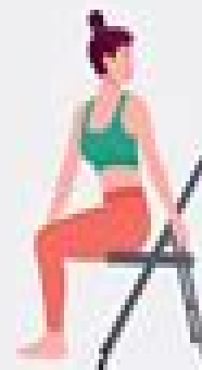
SEATED SIDE BEND