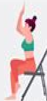
SEATED LEG LIFT