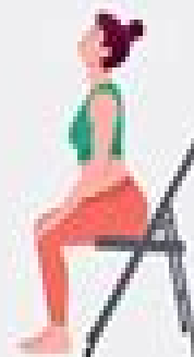
SEATED SIDE STRETCH