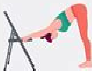
STANDING FORWARD BEND