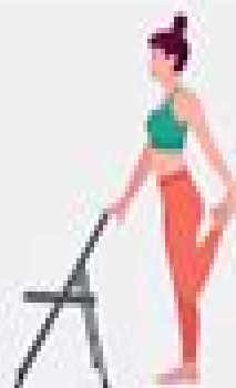
STANDING LEG LIFT