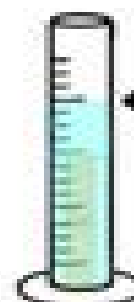
Final Volume of water (after adding coins)