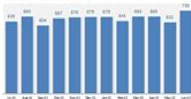
Entries 12 months to Jun 12