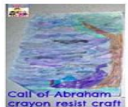
Call of Abraham crayon resist craft