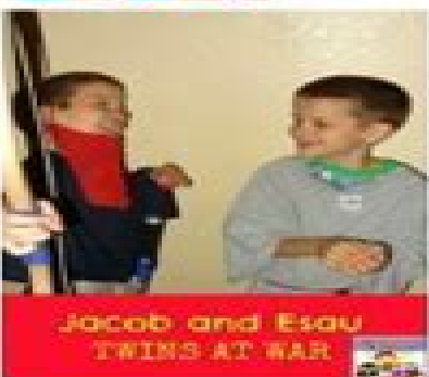
Jacob and Esau TWINS AT WAR