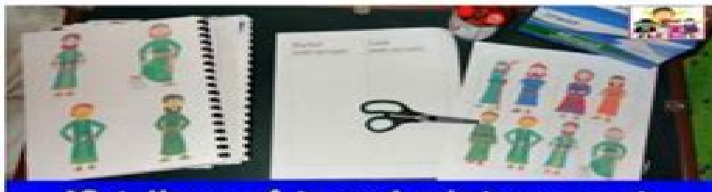
10 Bible stories of Genesis in a book

from "In the Beginning" to Joseph's big reveal