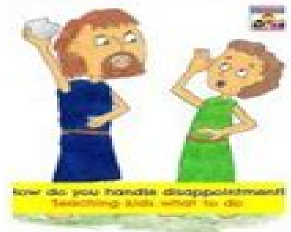
How do you handle disappointment? Teaching kids what to do