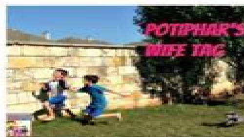
POTIPHAR'S WIFE TAG