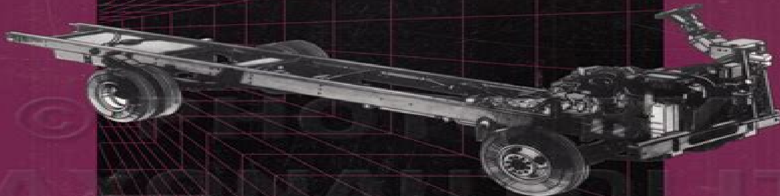
Class A Motorhome