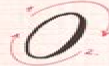
6. REVERSE OVAL