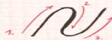
4. COMPOUND CURVE