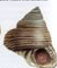
Ribbed Top Shell (W)

Hydrobia ulitiformis To 1 in. (2.5 cm) high Cone-shaped shell is blackish to brownish-gray. Feeds on biofilms.