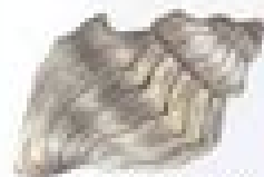
Frilled Dogwhelk (W)

Collusioidea ligatum To 1 in. (2.5 cm) high Pearl-like, strongly ridged shell is as wide as it is high.