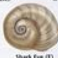
Shark Eye (E)

Tegula funiculata To 1 in. (2.5 cm) Rounded, black shell with a smooth apex.