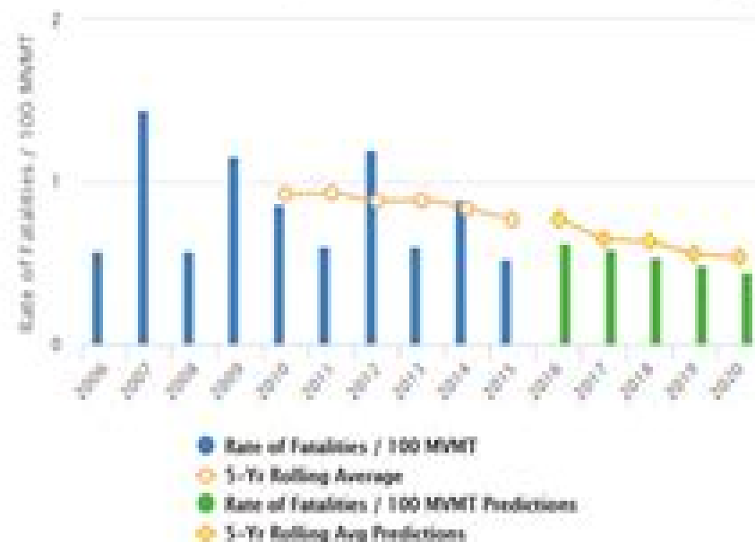
Fatalities / 100 MVMT - BERKELEY