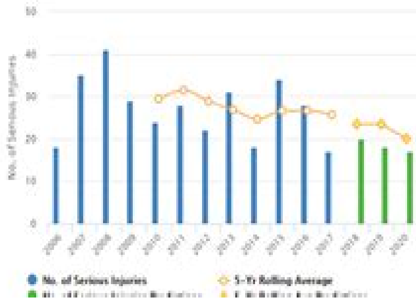
Serious Injuries - BERKELEY