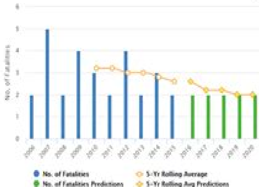
Fatalities - BERKELEY