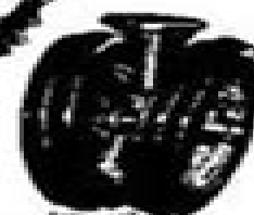
"MAG-13" DUAL FRONT WHEELS