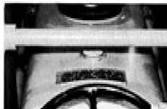
Figure 4 - K349136