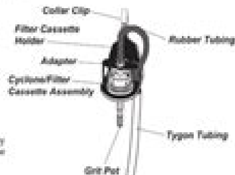
Figure 3 Cyclone with filter cassette in holder