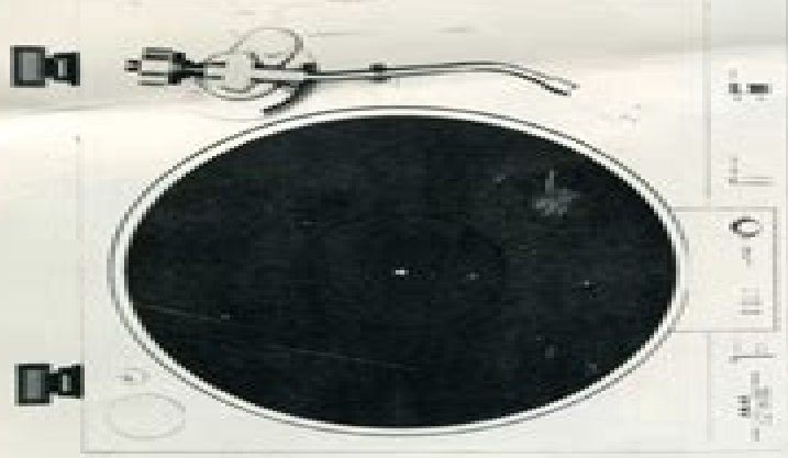
AP-D30/D30C Directdrive afbeelding