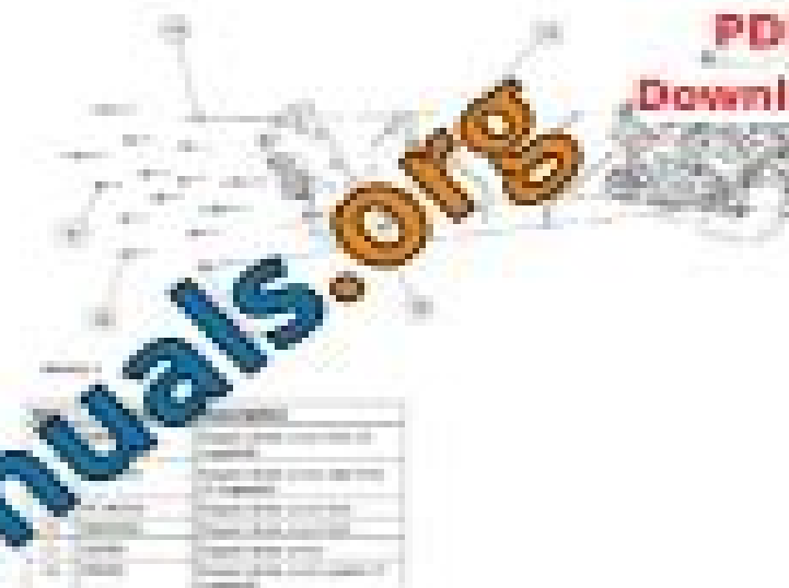
Fig. 28. Identifying Upper Front Cover Components (DR)