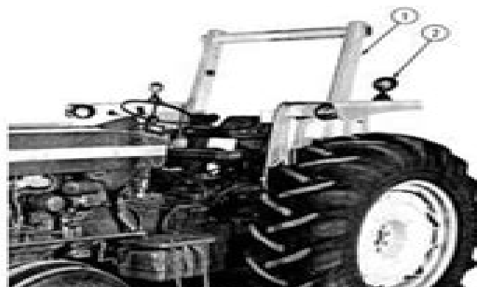
Figure 2 Two-Post Roll Over Protective Structure (ROPS)

All tractors equipped with a ROPS or cab are also equipped with a seat belt which, when used by the operator, maximizes the protection offered by the ROPS. ALWAYS use your seat belt when the ROPS is installed—seat belts save lives when they are used. Do not use your seat belt when the ROPS is not installed on the tractor.