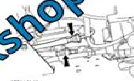
Fig. 17. Quick-release couplings connecting fuel hoses to fuel pipes. (200 variant shown.)

Compress the tops of the pinion couplings on the fuel feed and return lines and disconnect the hoses from the injectors, Fig. 17.