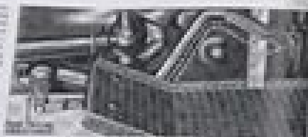
Fig. 1000—Clutch pedal mechanism for Model 300

The Model 300 is a new model motor vehicle, built in one piece, and is designed for long life and low maintenance. The new design is a result of the Ford engineering staff's study of the needs of the motorist and the requirements of the automotive industry. The new design is a result of the Ford engineering staff's study of the needs of the motorist and the requirements of the automotive industry.