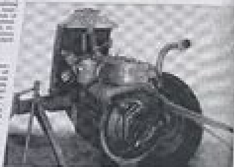
Fig. 1001—Front steering mechanism for Model 300