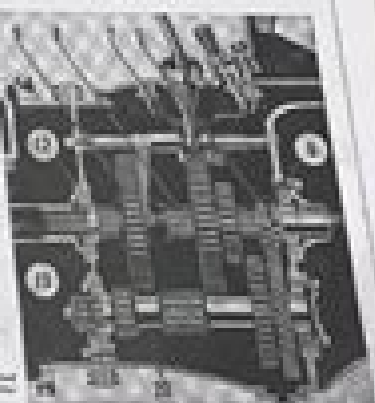
Fig. 1004—Front steering mechanism for Model 300

The new Ford transmission is a major advance in design and construction. It is a complete unit, built in one piece, and is designed for long life and low maintenance. The new design is a result of the Ford engineering staff's study of the needs of the motorist and the requirements of the automotive industry.