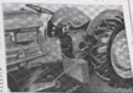
Fig. 1003—Front steering mechanism for Model 300

The Model 300 is a new model motor vehicle, built in one piece, and is designed for long life and low maintenance. The new design is a result of the Ford engineering staff's study of the needs of the motorist and the requirements of the automotive industry. The new design is a result of the Ford engineering staff's study of the needs of the motorist and the requirements of the automotive industry.