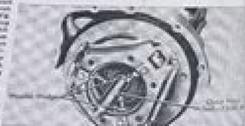
Fig. 1002—Clutch pedal mechanism for Model 300