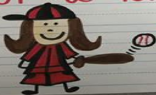
swinging a bat

Motion is the change in position of an object because of a force.