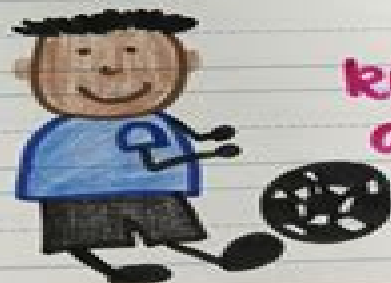
kicking a ball