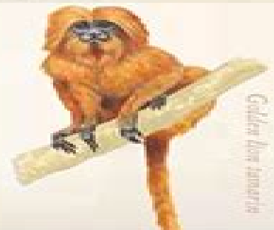
Golden lion tamarin