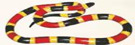
Eastern coral snake