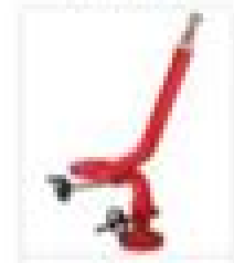
Stand Post Type Water Monitor