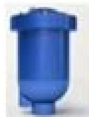
air release valve