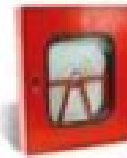
fire hose box