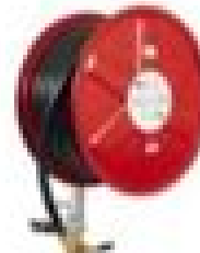
Fire Pipe Reel