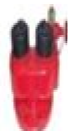
Two Way Branching Inlet Branching