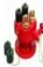
Four Way Inlet Branching