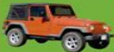
4 X 4