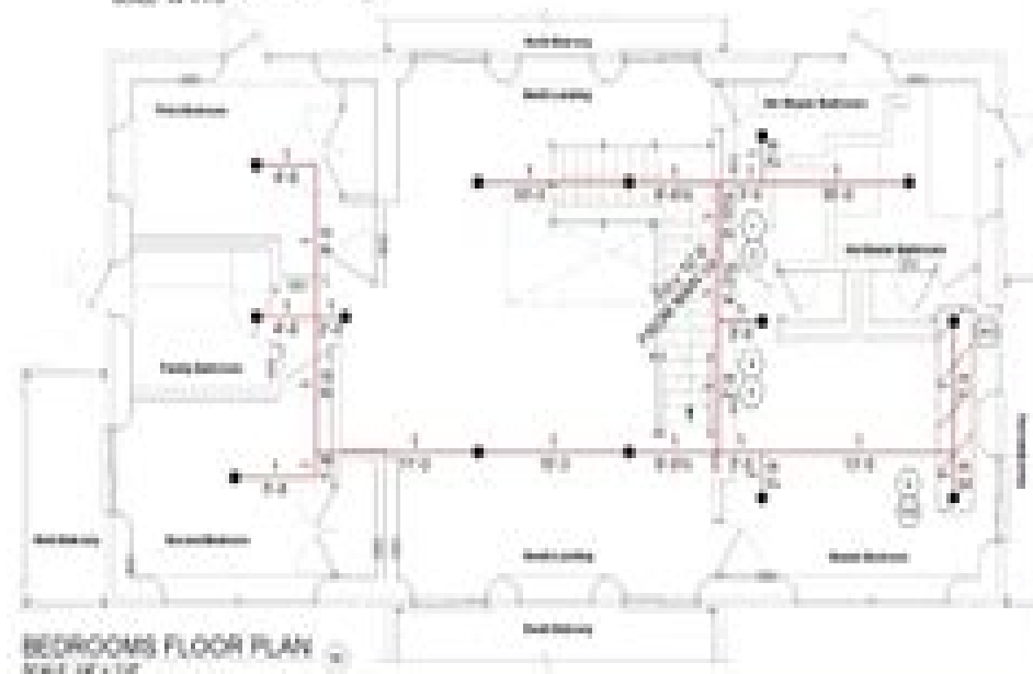
RECOMMENDED FLOOR PLAN