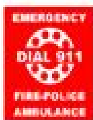
Emergency contact information