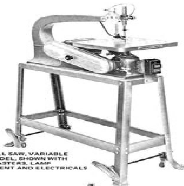
24" SCROLL SAW, VARIABLE SPEED MODEL, SHOWN WITH STAND, CASTERS, LAMP ATTACHMENT AND ELECTRICALS