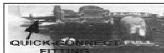
Fig. 10 To service the tank, disconnect the fuel line from the quick-connect fitting. ...