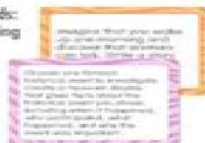
Curriculum Cut-Outs Story Starters CD-120488 CD-120491