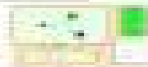
Figure 1: Laboratory setup

Calculate the initial momentum (before the collision) and the final momentum (after the collision) for each collision. Compare the initial and final momentum. The law of conservation of momentum states that the total momentum of a system is conserved. If the initial momentum is not equal to the final momentum, there is an error in the experiment. This is because the system is not isolated or there is an external force acting on it.