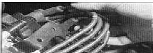
A Check that the spark plug HT leads (where applicable) are securely connected by pushing them home.