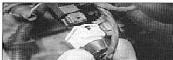
B The throttle potentiometer wiring plug may cause problems if not connected securely.