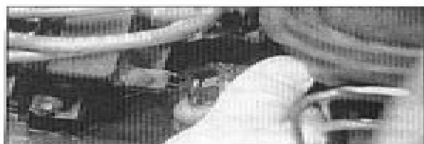
E Check that the ignition coil wiring plug is secure, and spray with water-dispersant if necessary.