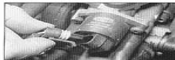
C Check the idle speed stepper motor wiring plug for security.