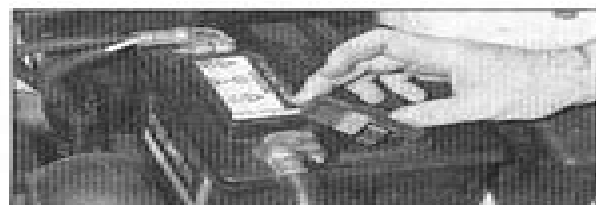
D Check the security and condition of the battery connections.