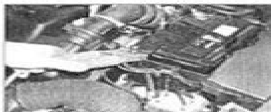
1 Connect one end of the red jump lead to the positive (+) terminal of the car battery.