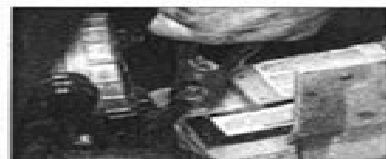
3 Connect one end of the black jump lead to the negative (-) terminal of the booster battery.