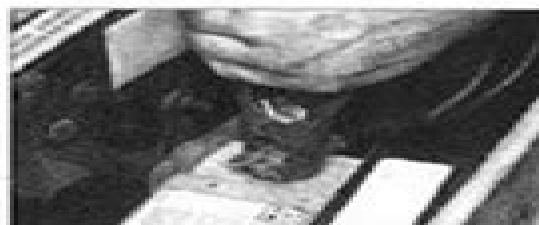
2 Connect the other end of the red lead to the positive (+) terminal of the booster battery.