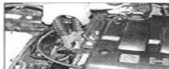
4 Connect the other end of the black jump lead to a bolt or bracket on the engine block, well away from the battery, on the vehicle to be started.