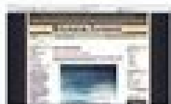
View on Online

3000 Locust St.(Side Entrance) Philadelphia, PA, 19104 Tel: 215.382.3382 Fax: 215.382.3392 Email: order@authenticstatements.com www.authenticstatements.com