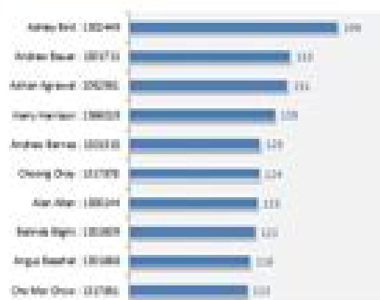
Annual Leave Days