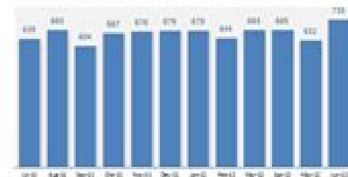
Entries 12 months to Jun 12