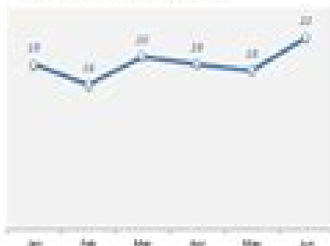
Timewriting Cost 2012 ($m)