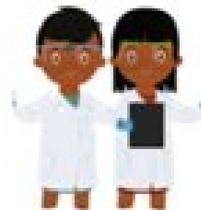
Professor Predict & Esme Explain