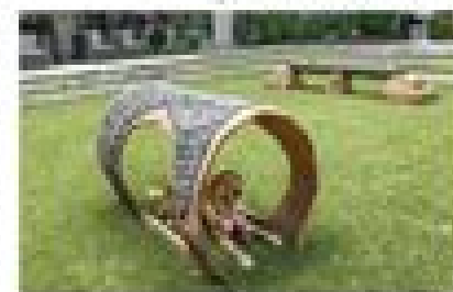
8. HOLLOW LOG TUNNEL HOUSE