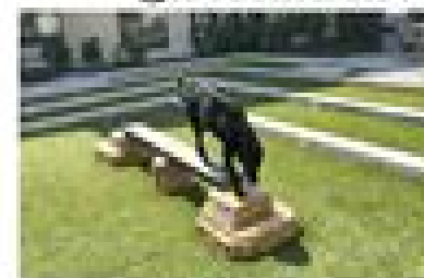
10. BALANCE BEAM