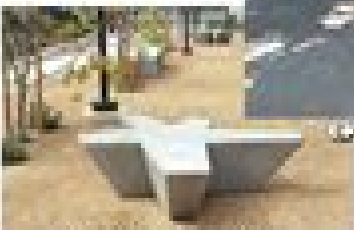
4. CONCRETE SEATING