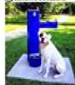
7. DRINKING FOUNTAIN