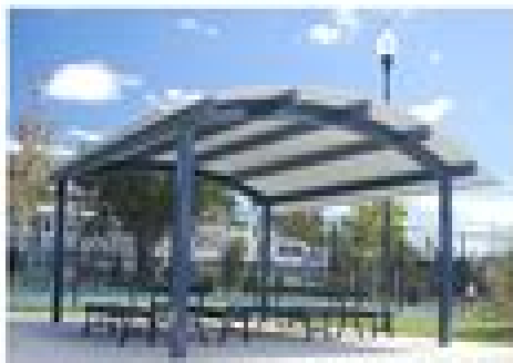
1. LARGE DOG PARK SHADE SHELTER