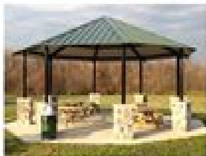
5. SMALL DOG PARK SHADE SHELTER