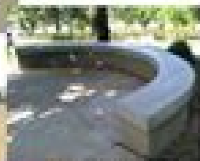
3. BENT WALL IN PLACE