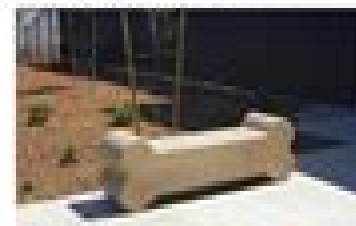
9. CONCRETE DOG BONE BENCH